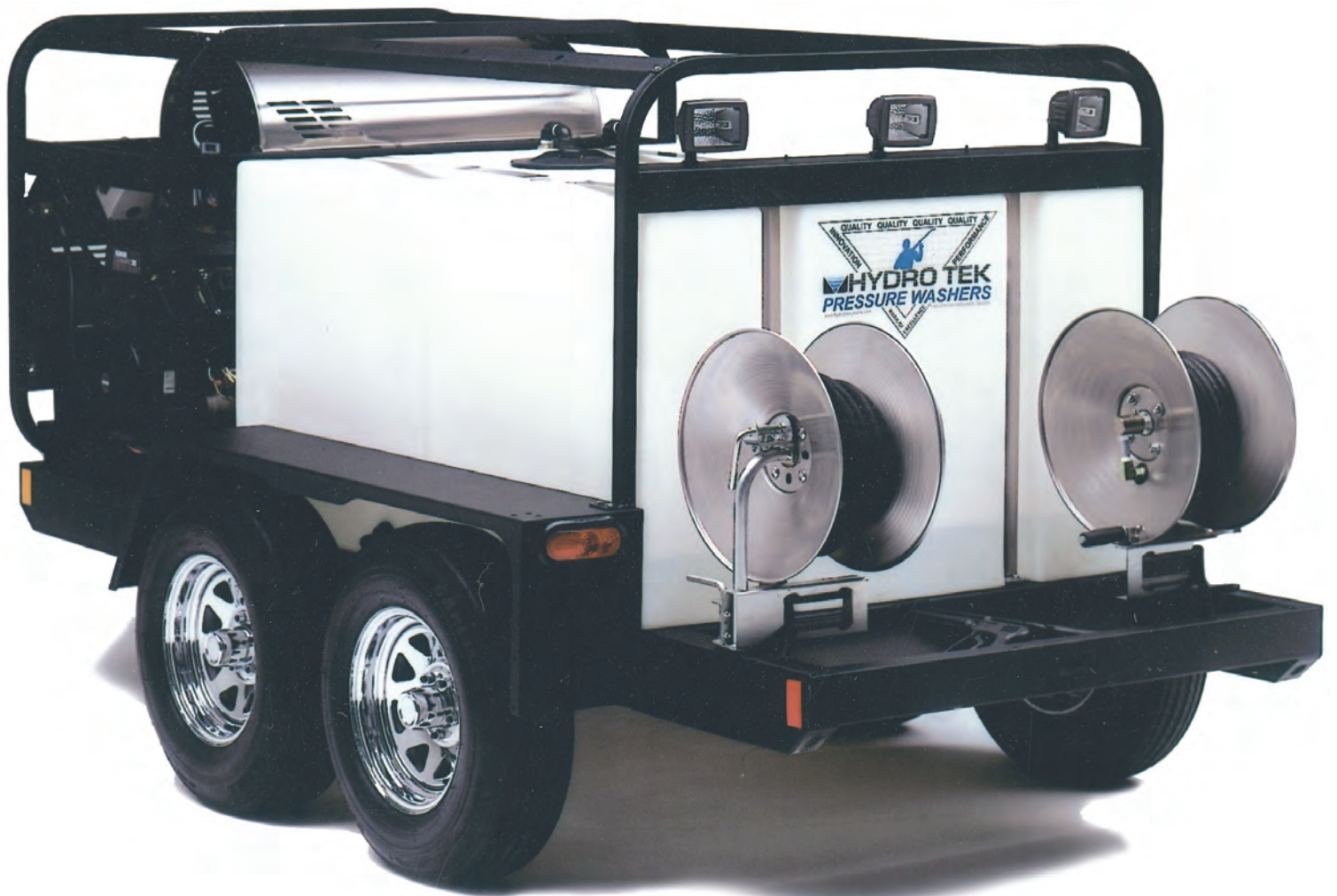
PRO TOW WASH shown with options