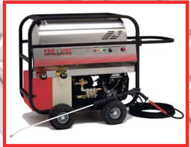
SS SERIES SHOWN WITH WHEEL KIT

SS/SC SERIES: GAS OR DIESEL POWERED, DIESEL FIRED