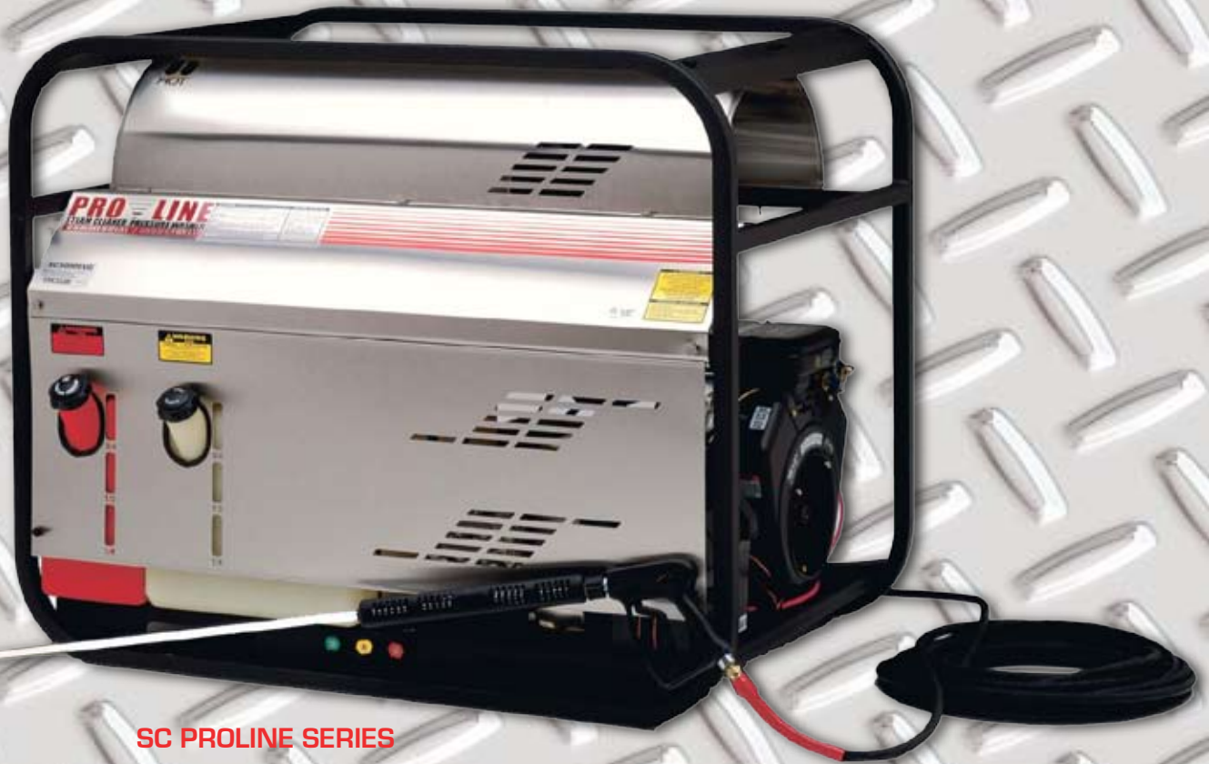
SC PROLINE SERIES