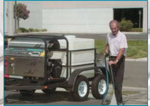
TRUCK OR TRAILER MOUNT

SC SERIES: GAS OR DIESEL POWERED, DIESEL FIRED