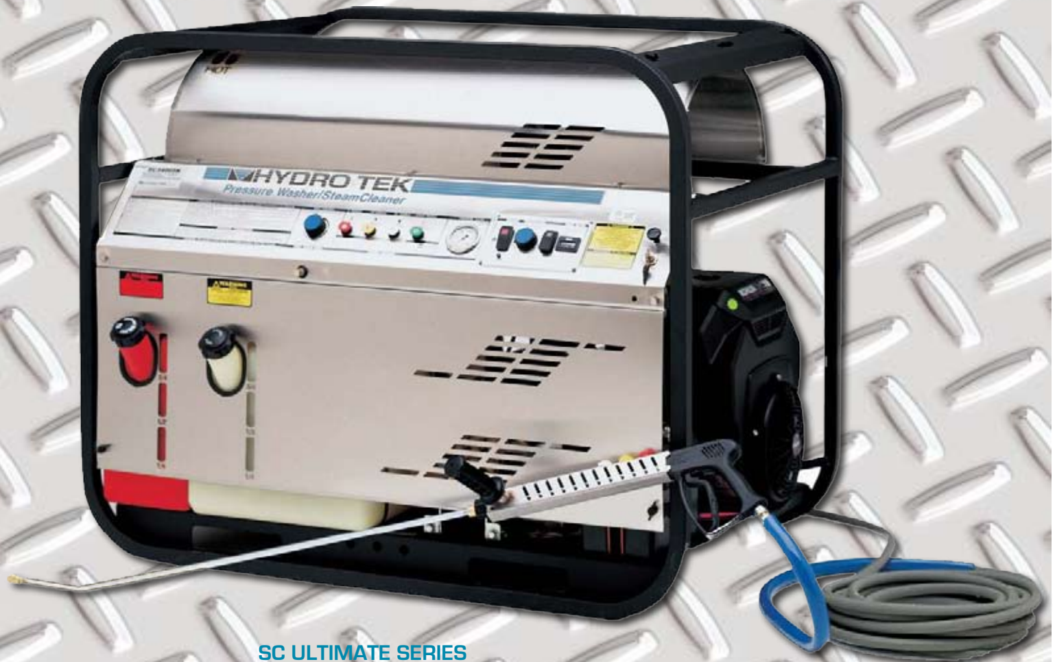
SC ULTIMATE SERIES