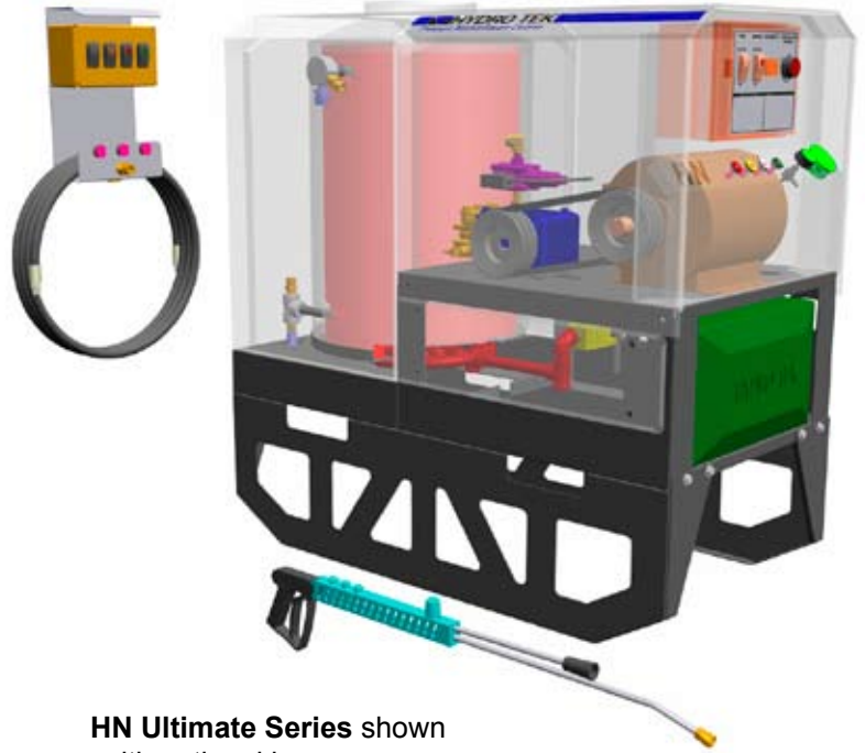
HN Ultimate Series shown with optional burner cover

Pump cooling system prevents pump from overheating in bypass for worry free operation. (Remote wash station and pressure gage not included on HN Proline™)